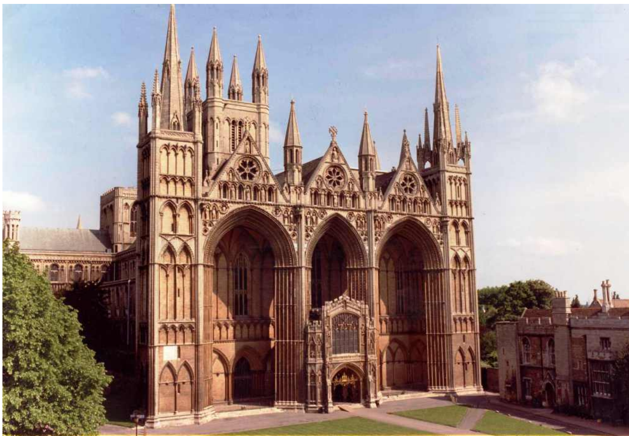
Peterborough Cathedral – Host of the 2010 Centenary Federation AGM